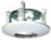
In-ceiling mount DS-1227ZJ