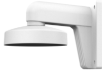
Wall mount DS-1273ZJ-135