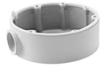
Junction box DS-1280ZJ-DM21