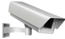
Non-PoE IP Camera