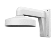
DS-1273ZJ-140 Wall Mounting Bracket